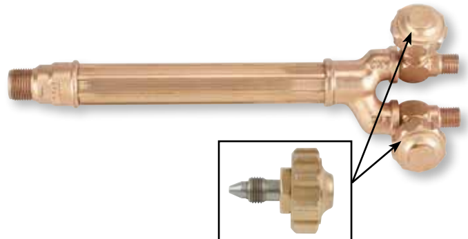
Precise Needle Valve Control