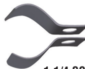
1-1/4 SCB 1-1/4" Side Cutter Blade (2 piece set)