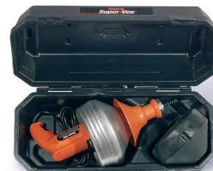
MCC Carrying Case

General General Wire Spring Co. PIPE CLEANERS McKees Rocks, PA 15136 USA 800-245-6200 or 412-771-6300