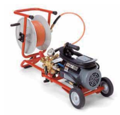
Model KJ-1350-C on Model H-10 Cart