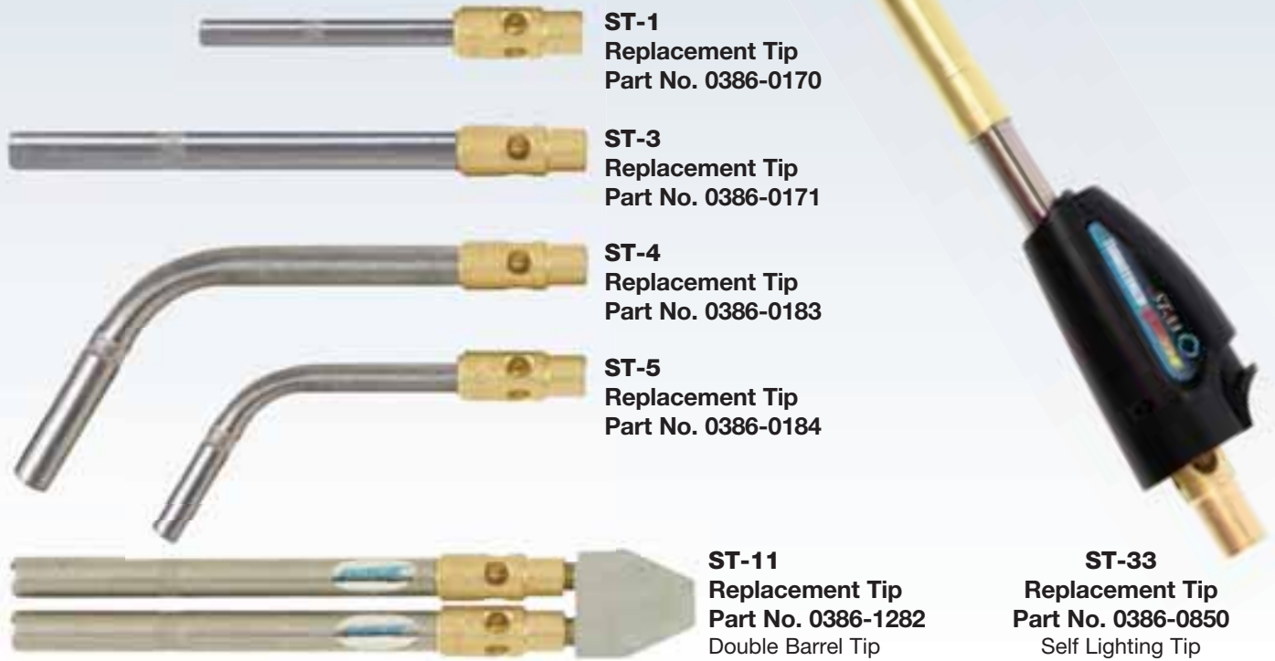
ST-1 Replacement Tip Part No. 0386-0170