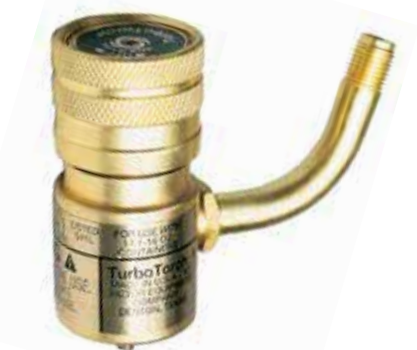
STK-R Regulator Part No. 0386-0687 CGA 600 Connection