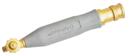
WA-400 Torch Handle Part No. 0386-0410