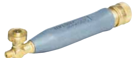
G4 TurboTorch® Torch Handle Part No. 0386-0308