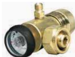
AR-B Regulator Part No. 0386-0725