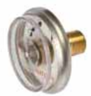
AG-1 Regulator Part No. 0386-1200 (gauge only)