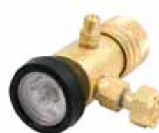
AR-MC Regulator Part No. 0386-0726