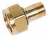
BTMCR Adapter Part No. 0386-0503