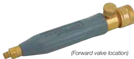
PLF-A5 Proline® Torch Handle Part No. 0386-0872