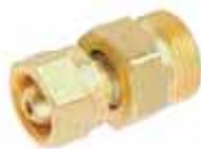
MCT Adapter Part No. 0386-0505