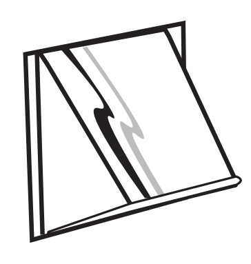
DAV4/48 (hood only)