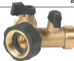
20123 Brass Y-Valve