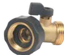
20173 Brass 45° Valve