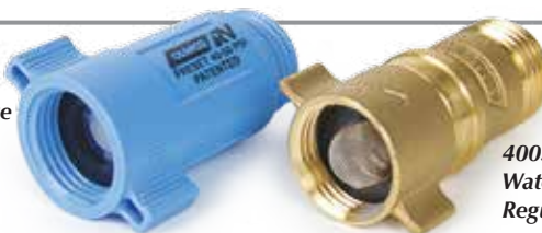
40055 Brass Water Pressure Regulator