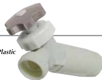
11523 Water Heater Drain Valve - Plastic