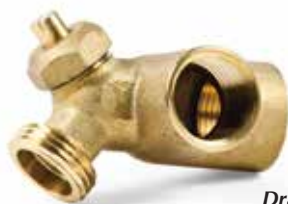
11502 Drain Valve with Recirculation Elbow