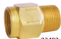
23402 Backflow Preventer