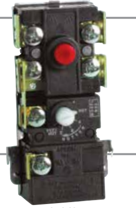
07843 Single Element Thermostat