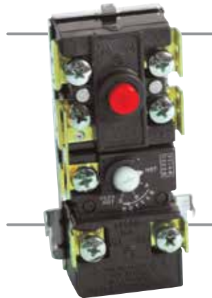
07863 Upper Thermostat