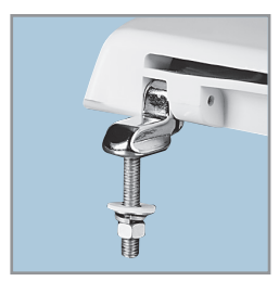
300 SERIES STAINLESS STEEL SELF-SUSTAINING HINGES (1950SS)