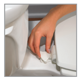
TWIST HINGES TO UNLOCK