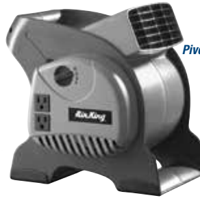
Pivoting Utility Blower 9550