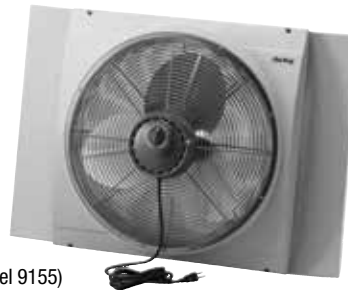
Whole House Window Fan 9166