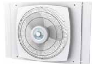
Window Fan 9155