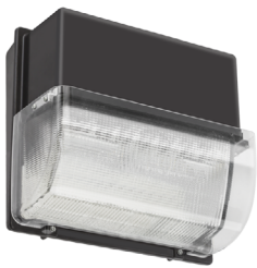
VG - Vandal guard