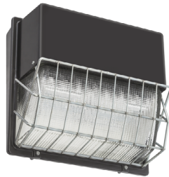
WG - Wire guard