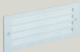
Louvered Faceplates 9DTT 13DTTE (4-pin only)