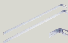
LBH Extended bar hangers used for extreme off-center mounting in a 24" space. Set of two 22" bar hangers. For use with 4", 5" or 6" frame-ins only.