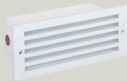
Slotted 9DTT 13DTTE (4-pin only)

FPL White Louvered FPLBL Black Louvered FPS White Slotted FPSBL Black Slotted FPO White Opal FPOBL Black Opal