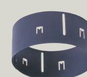
CTE Use when ceiling thickness is greater than 1-1/2". Maximum thickness 2" (5.1cm). For use with 6" reflectors only. Not compatible with VPE2, VMB4, F6-Series and 7-Series reflectors.