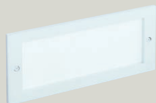
Opal 9DTT 13DTTE (4-pin only)