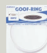
CTR5 7-1/8" (19.9 cm) O.D. Use with J Series trims only.