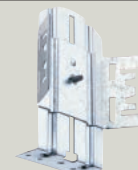
LCMB Used when commercial channel bars are desired to mount fixture. Channel bars not included. Set of two brackets. For use with 4", 5" and 6" frame-ins only.