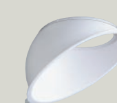
SCA Sloped ceiling adapter. Compatible with 8 inch and 6 inch commercial fixtures. Available in 5-degree increments, 10 degrees through 30 degrees. White only. See chart for fixture compatibility. Ex: SCA6 15D