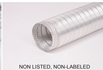
NON LISTED, NON-LABELED