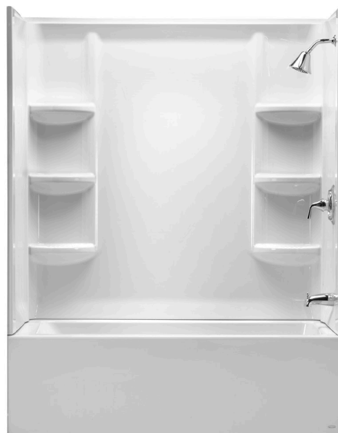
Studio walls 2946BW shown with Studio Bathing Pool 2946202